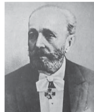
Marius Petipa (1822-1910)

The choreographer Marius Petipa (1822-1910) is responsible in large part for revitalizing ballet as an art form. A ballet master and choreographer from France, Petipa arrived in Russia in 1847. During his 60-year career at the Mariinsky Theater's Imperial Ballet, he created 46 new ballets and revised 17 more. Petipa's genius was for combining the basic steps and movements of classical ballet into endlessly innovative patterns and inventive variations. His ballets were lavish, multi-act spectacles with romantic or storybook plots. They were filled with regal processions, folk and national dances, mime and divertissements (suites of dances that have nothing to do with the plot but are meant purely to entertain or show off the talents of the dancers), as well as numerous solos, duets, trios and ensembles for waves of dancers who crisscrossed the stage in intricate designs.