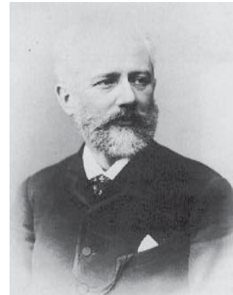
Pyotr Ilyitch Tchaikovsky (1840-1893)

Russian-born composer Pyotr Ilyich Tchaikovsky (1840-1893) did more than any other composer to elevate the quality of ballet music in the 19th century, making it an equal partner of the choreography. His ballet scores are symphonic and filled with rich melodies; they are evocative and speak directly to the listener's emotions. His scores are not just unrelated tunes strung together; his music helps tell the story. In addition to three ballet scores, Tchaikovsky produced nine operas, six symphonies, three string quartets, numerous chamber works and concertos for various instruments, overtures, short pieces for piano and over 100 songs and choral works.