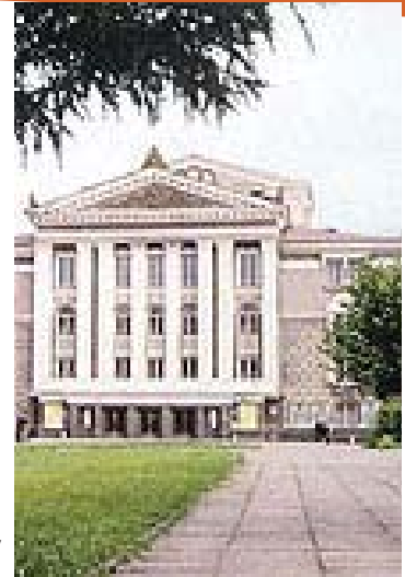
The Tchaikovsky Opera & Ballet Theater in Perm, Russia

The Tchaikovsky Opera and Ballet Theater is based in Perm, a port city in the Russian Urals. Perm, which has more than 1.2 million inhabitants, is located 1,000 miles from the capital city of St. Petersburg. The opera company of The Tchaikovsky Opera & Ballet Theater was founded 1870, and the ballet company became a permanent institution in the mid-1920s. Known for its exemplary productions of the operas and ballets by Peter Ilyich Tchaikovsky, the Tchaikovsky Opera and Ballet Theater has also produced and performed a growing number of other classical and contemporary works. The Tchaikovsky Perm Ballet Orchestra, a company of 125 dancers, soloists, and musicians, is one of Russia's most distinguished arts organizations. It is unique in that it draws all of its dancers from its own school, the most prestigious training institution for ballet in all of Russia.