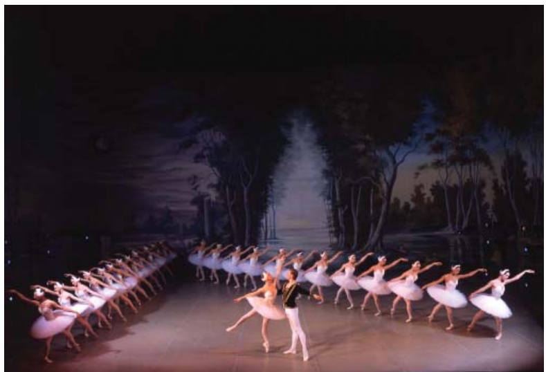
Odile and Siegfried in Scene II