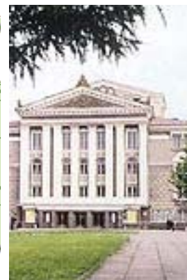
Above: Map of Russia with close-up of Perm, Russia. Right: The Tchaikovsky Opera and Ballet Theater located in Perm, Russia.

has also produced and performed a growing number of other classical and contemporary works. The Tchaikovsky Perm Ballet Orchestra, a company of 125 dancers, soloists, and musicians, is one of Russia's most distinguished arts organizations. It is unique in that it draws all of its dancers from its own school, the most prestigious training institution for ballet in all of Russia.